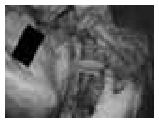
Figure-3. (Case 4th in table-1): Two nylon bags with openings in the apical portions of the head and tied tightly to the neck region by binding to the head were observed