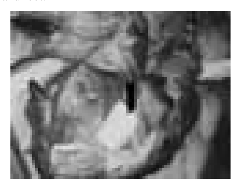
Figure-1. (Case 8^{th} in table-1): This case was found tied with a nylon ligature around the knees and the back in a knees-on abdomen position

In all 10 corpses found in the first house and in the 6 corpses found naked in the second house it has been observed that putrefaction advanced, all of their epidermis peeled, their hairs shed, saponification began, and their faces became un-recognizable. For the remaining three victims found in a dressed position it has been observed that rigor mortis disappeared, livor mortis occurred independent localizations in front and behind of their bodies, intensive petechial spots occurred among the livor mortis bleeding occurred from their mouths and their noses and sign of laundress hand existed on their hands and feet.