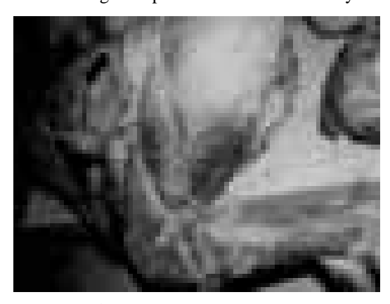
Figure-2. (Case 9<sup>th</sup> in table-1): The knees were drawn to the abdomen with a ligature tied with a double-line passing under the knees and then extending through the back.

DNA analysis that the 11 victims were the people who had been missing for a period of 2 months to one year.