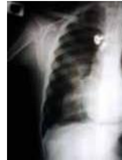
Fig. 2 (a/b). Bilateral pneumothorax and bilateral apical subcutaneous emphysema in PA radiograph of chest after intubation