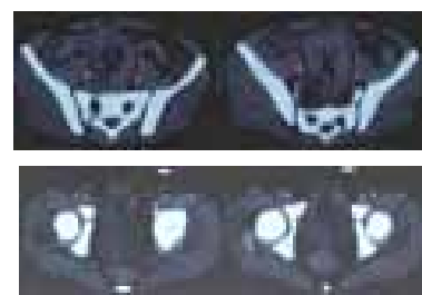
Fig. 4(a-b). Bilateral inguinal subcutaneous emphysema (at all scans) in abdominal CT

At following day of hospitalization, level of blood glucose as 102 mg/dl and CK/MB as 45.17 U/l were defined.